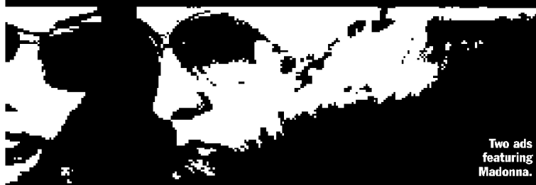
Two ads featuring Madonna.